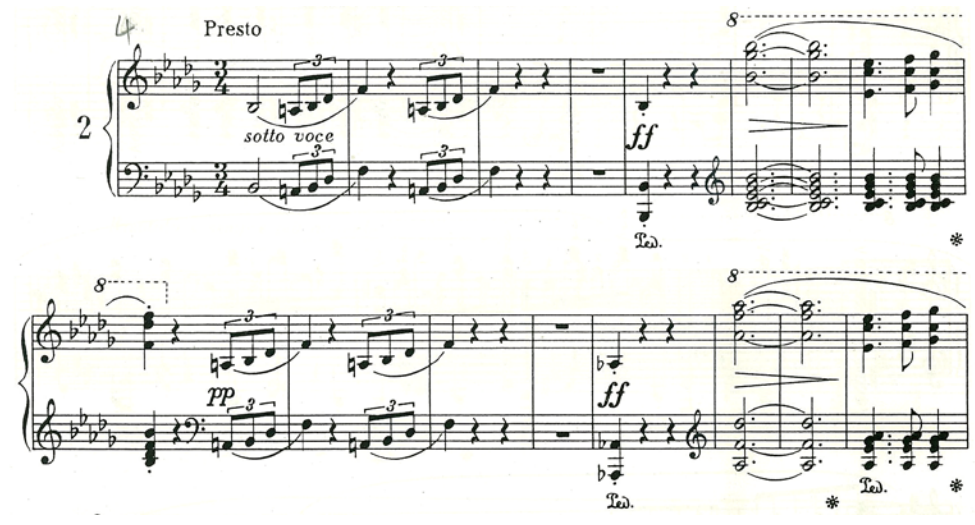
Sample 5 1-16

Chopin has boldly reformed traditional harpsichords in the use of tonality, and has "freely explored the relationship between tone and contrast in the tonality and additional colors." In Scherzo No. 2 in B-flat minor , the music begins in b flat minor, but it ends in D flat major. Two completely different modes do not have a master/slave distinction, but blend with each other but show up independently. The composer's jaw-dropping ability to innovate and use sophisticated techniques.