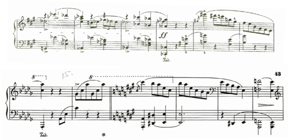
Chopin's great achievements in harmony made him unique in the music field in the early 19th century. Scherzo No. 2 in B-flat minor has bold and harmonious language and rich artistic expression. He is still loved by music lovers.