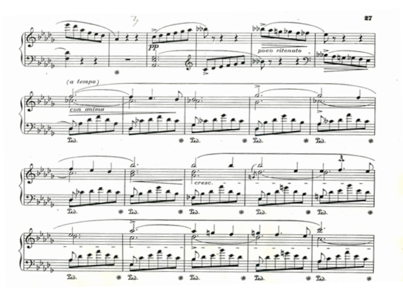
Sample 4 52-80

In Chopin's writing, vocal melody and instrumental melody are sometimes not so clear, the author consciously transforms the two into each other, when the melody with vocal characteristics gradually transforms into instrumental melody, or the instrumental melody transforms into vocal in the next phrase When it comes to sexual melody, it creates a dramatic and dramatic effect that greatly enhances the musical expression of the work. Obviously, the transformation between the two melodies is even more difficult. This is one of the reasons that Chopin's contemporary composers rarely attempted this technique. Chopin's skillful use and control of the changes between vocalized melody and instrumental melody, demonstrated composer's creative skills. For example, the latter half of the first theme of the music development department began as a melodious melodious melody, with a melodious and harmonious mood under the embellishment of delicate decoration, and the sentence endings changed gradually from high to low. The decomposition chord type, which is obviously a melody with instrumental characteristics. The melody melody and instrumental melody have appeared one after another, giving people a very deep impression. (See Sample 2)